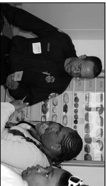
MAAPFA member showing Fire Protective equipment and technology to students at the Science Museum of Minnesota