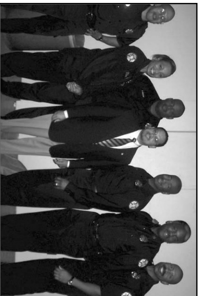
Minneapolis & St. Paul Black Firefighters with U.S. Rep. Keith Ellison

Last, but not least, MAAPFA has an on-going commitment to our youth from school involvement with our fire safety programs, fire service awareness and recruitment presentations, to stay-in school and graduate presentations. As a result of our great work, the International Association of Black Professional Firefighters' awarded MAAPFA with the 2008 Community Service Award.